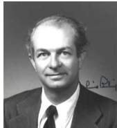
Dr. Linus Pauling

Chemical imbalance in the brain is the most common explanation for mental disorders. Nutrients are chemicals that the brain requires in order to work correctly. For example, nutrients such as zinc, vitamin B 6 and vitamin B 12 are needed to make and regulate neurotransmitters, which are essential in sending brain signals. 1,2,3,4 Lack of these nutrients may cause the chemical imbalances of mental illness.