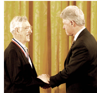
Dr. Bruce Ames receiving the national medal of science from President Bill Clinton

Dr. Ames has shown that deficiencies in iron, zinc, folic acid, niacin, and vitamins B 12 , B 6 , C, and E cause mutations in the same way that radiation does, leading to cancer, premature aging, and possibly neuron decay, cognitive dysfunction, mental illnesses, and degenerative diseases like Alzheimer's. 7,8 Half of the U.S. population may be deficient in one or more of these nutrients. 9 For folic acid alone, ten percent are deficient at levels known to cause breaks in human DNA. 10